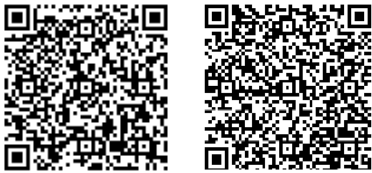
FOR ios FOR Android

“Safety Tips” provides disaster information to foreign visitors. Useful disaster-related information is provided in 11 languages (English, Korean, Chinese (Simplified/Traditional), Vietnamese, Spanish, Portuguese, Thai, Bahasa Indonesia, Tagalog, Nepalese, Japanese).