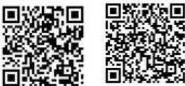
FOR ios FOR Android

Various news is broadcast in 17 languages (English, Arabic, Bengalese, Burmese, Chinese, French, Hindi, Bahasa Indonesia, Korean, Persian, Portuguese, Russian, Spanish, Swahili, Thai, Urdu & Vietnamese)