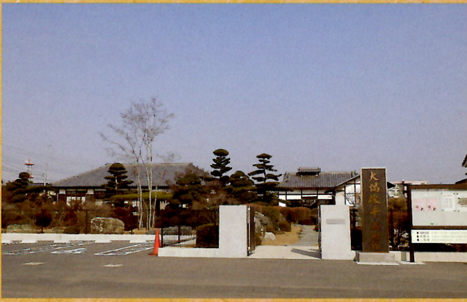
Full view of the museum