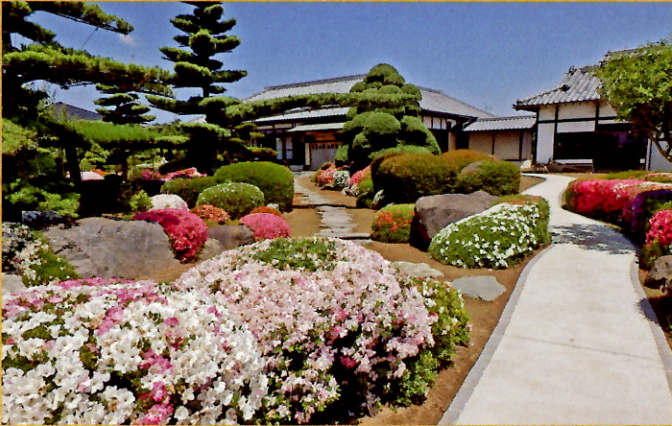
Garden with azaleas in full bloom