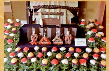
Decorations of the Double Ninth (Chrysanthemum) Festival