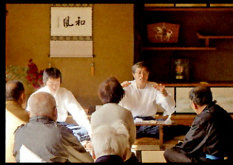
Lecture by swordsmith

Various events are held throughout the year at the museum.