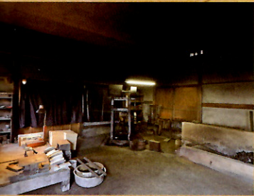
Interior of atelier