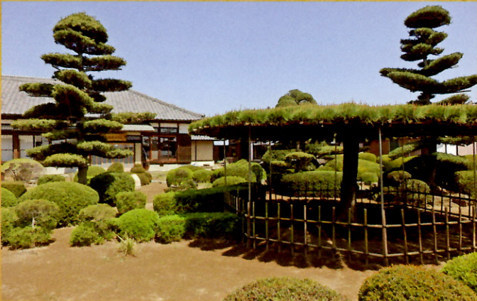
Japanese umbrella pine tree cherished by the swordsmith