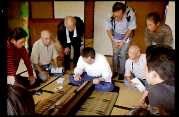
Demonstration of fullering