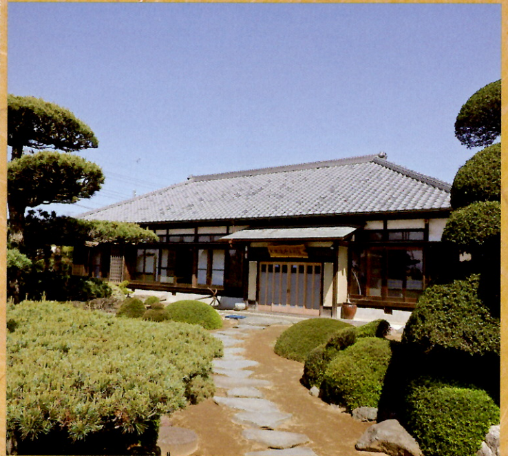
Former home converted into the museum