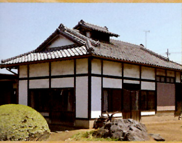
Exterior of atelier

Atelier used by swordsmith Osumi to make swords from 1979 to 2009. It has been left exactly as it was when in use. Demonstrations of sword making are performed by Osumi's apprentices.