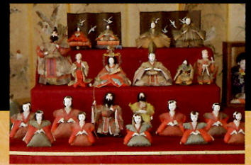
Hinamatsuri (Doll's Day) Decorations