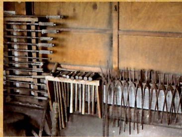
Tools for sword making