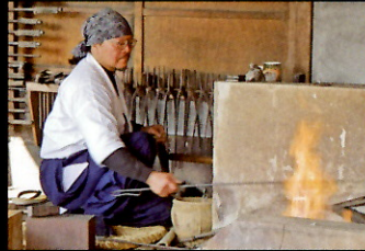
Demonstration of sword making