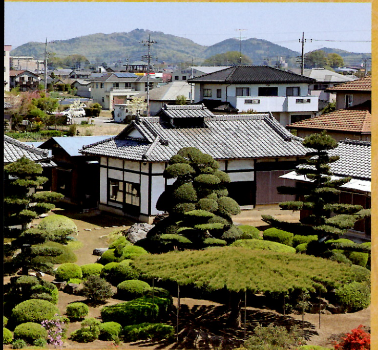
View of atelier and Mt. Kanayama