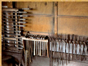
Tools for sword making

Atelier used by swordsmith Osumi to make swords from 1979 to 2009. It has been left exactly as it was when in use. Demonstrations of sword making are performed by Osumi's apprentices.