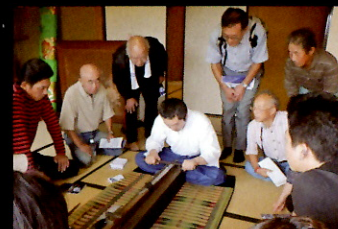
Demonstration of fullering

Various events are held throughout the year at the museum.