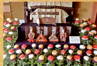
Decorations of the Double Ninth (Chrysanthemum) Festival

Other events and lectures are also held.