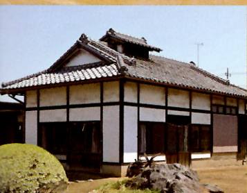
Exterior of atelier