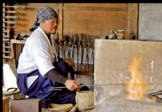
Demonstration of sword making