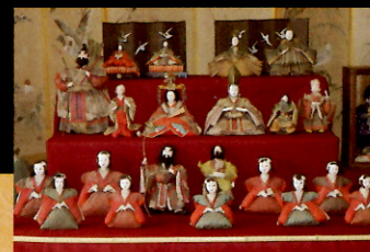
Hinamatsuri (Doll's Day) Decorations