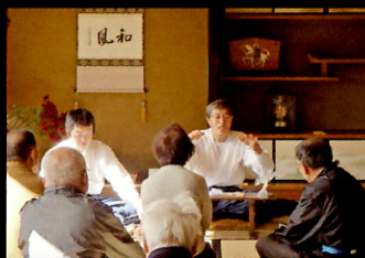
Lecture by swordsmith