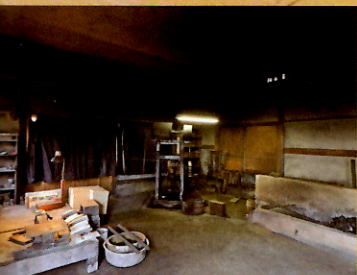
Interior of atelier