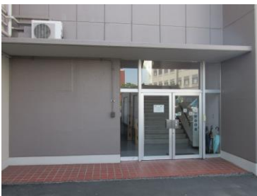
(Entrada lateral (leste))